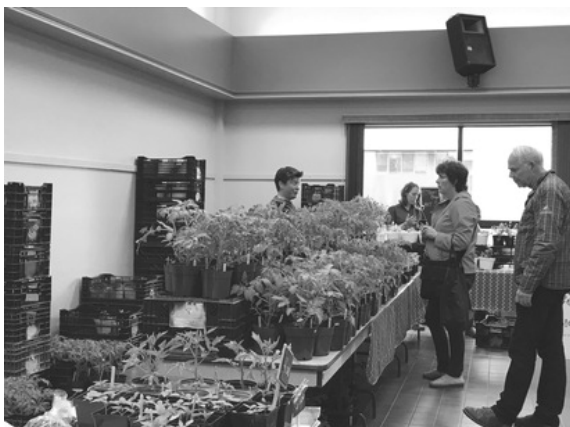
Great to see so many farmers on Saturday during Herb Day at the Farm Centre in Charlottetown.