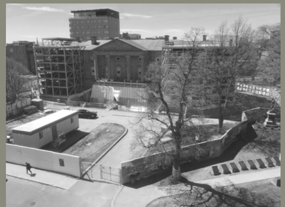
Province House under construction, the view from the attic.

Feel free to SHARE this newsletter with your friends.